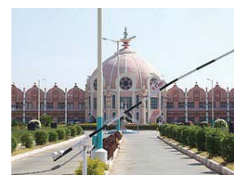
Sri Sathya Sai Institute of Higher Medical Sciences, Puttaparthi

The body is the boat on which we voyage across the ocean of worldly life and it has to be kept trim and seaworthy. The voyage too has to be strong, confident and courageous.