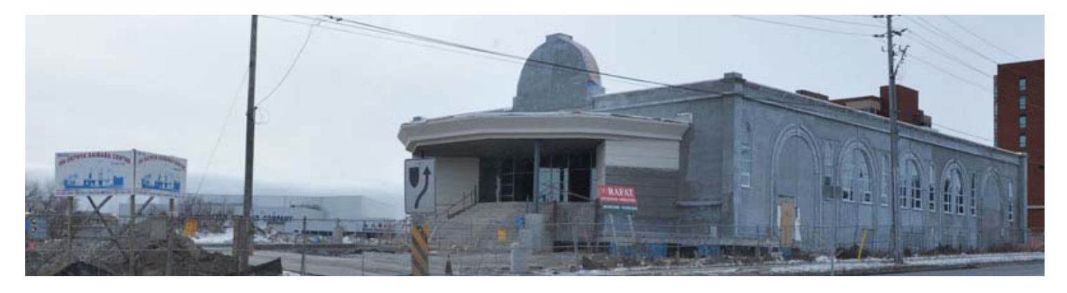
New Sai Center Building in Scarborough

Baba Center Sri Sathya Sai of Scarborough held its inauguration the ceremonies durina auspicious Easwaramma day weekend of May 6<sup>th</sup>, 7<sup>th</sup> and 8<sup>th</sup> as blessed by our Divine Lord Himself.